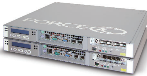
The Force10 Networks P-Series family of security appliances

“The Force10 P-Series is the only solution that allows us to secure our network at line-rate 10 Gigabit speeds.”