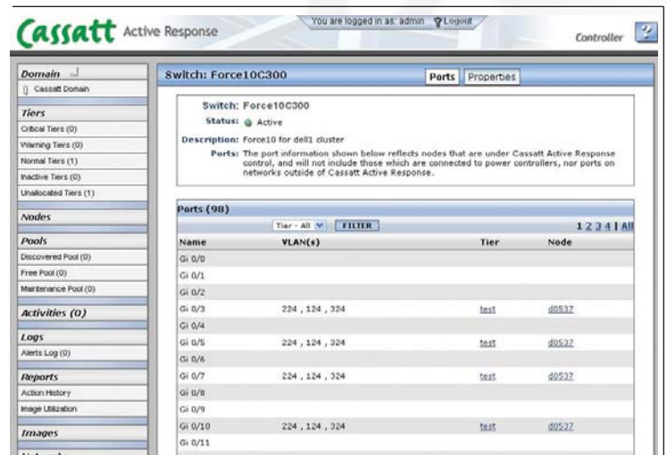
Figure 2: Current switch configuration report.

Multiply overall data center efficiency and increase service levels using fewer resources at greater energy efficiency.